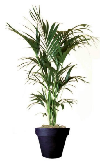
Réf. 113.200 - Kentia ht 1,80 / 2 m Réf. 134.359 - Vas three black