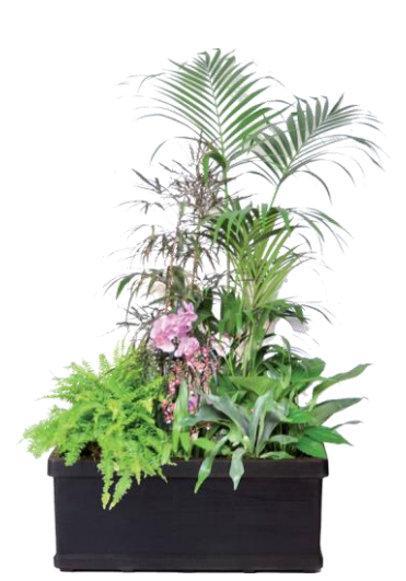
Réf. 143.200 - Rectanglar trough 100 x 32 cm

Our floral selection or composition is beyond the capability or creativity of our master gardeners. We guarantee to find the right arrangements for you.