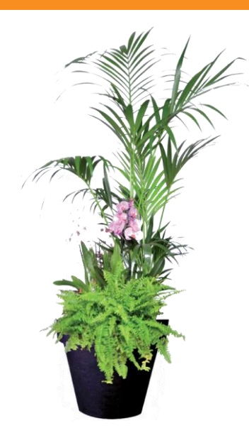
Réf. 144.200 Round troughs Ø 50 cm