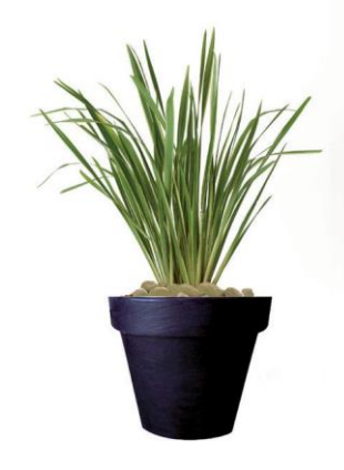
Réf. 112.300 - Phormium ht 1,20 / 1,50 m Réf. 134.359 - Vas three black