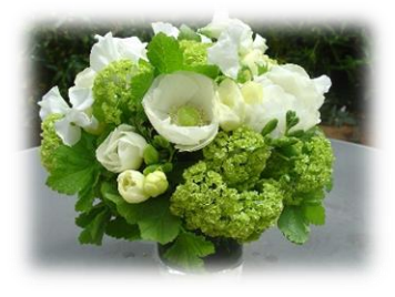
Réf. 181.200 - Round bouquet for counter Ø 30/40 cm Flowers according to availability of season

Réf. 181.100 - Floral compositions for tables Ø 10/15 cm Flowers according to availability of season