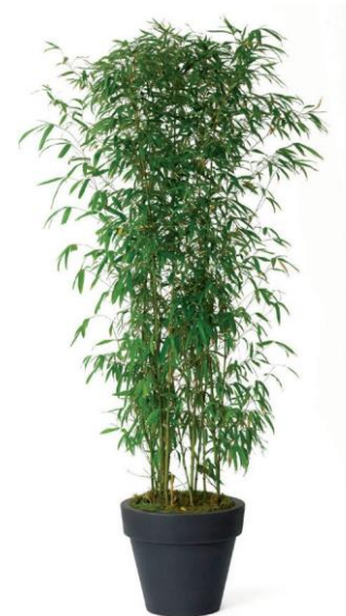
Réf. 111.110 - Bamboo hedge ht 1.50 / 2 m Réf. 134.359 - Vas three black