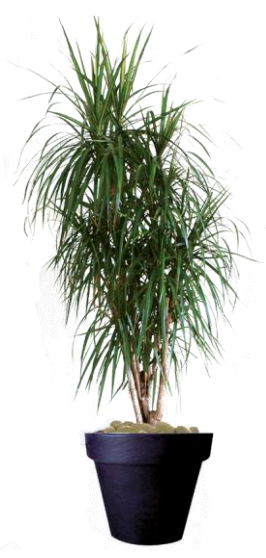
Réf. 113,135 - Dracaena maginata