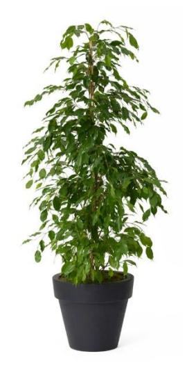
Réf. 113.160 - Ficus ht 1,80 m / 2 m Réf. 134.359 - Vas three black